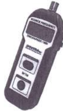
Figure 2-1, Source Frequency Test Meter (SFTM)

A source frequency test meter is required to check and /or adjust the excitation source of Spectroil M. Part No of SFTM is M90300, NSN 6625-01-419-5538. SFTM shown below :