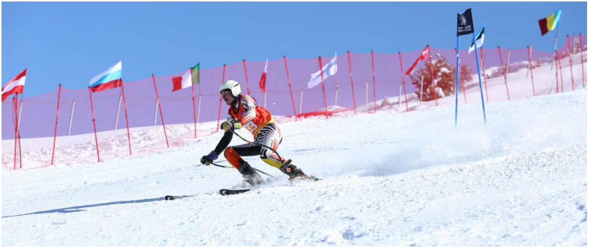
MALAM JABBA: An International Skier in an action during the Malam Jabba International Alpine Ski Cup held Ski Resort Malam Jabba, Swat.(28-01-2017)