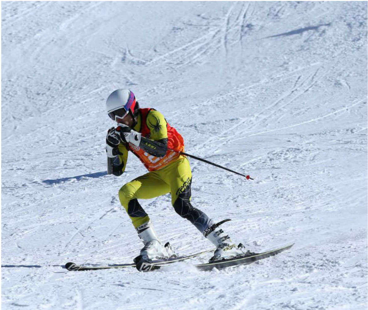
MALAM JABBA: An International Skier in an action during the Malam Jabba International Alpine Ski Cup held Ski Resort Malam Jabba, Swat.(28-01-2017)