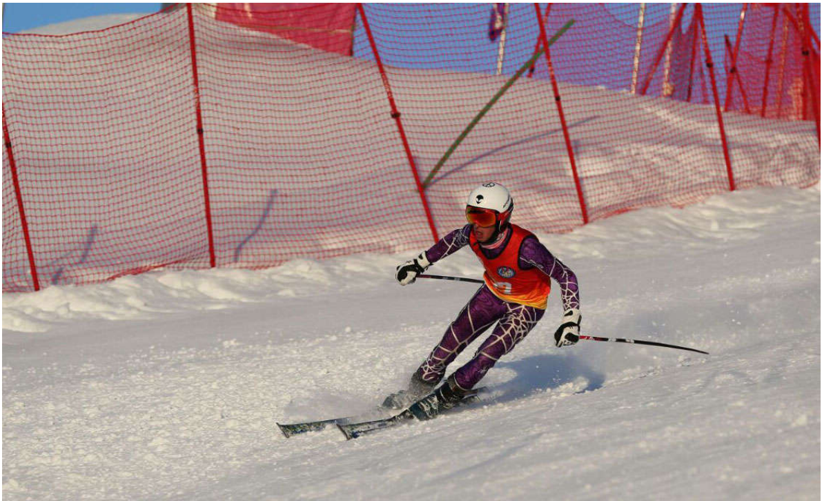
MALAM JABBA: An International Skier in an action during the Malam Jabba International Alpine Ski Cup held Ski Resort Malam Jabba, Swat.(28-01-2017)